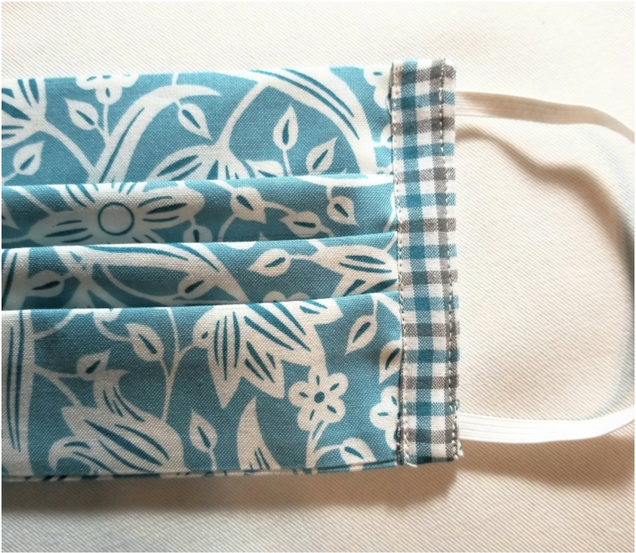
The front of your mask should now resemble the above picture.