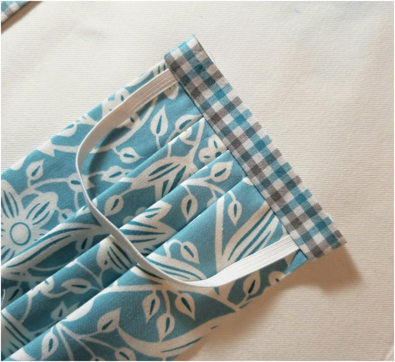
Flip the accent fabric strip outward away from the main pleated piece, then press.