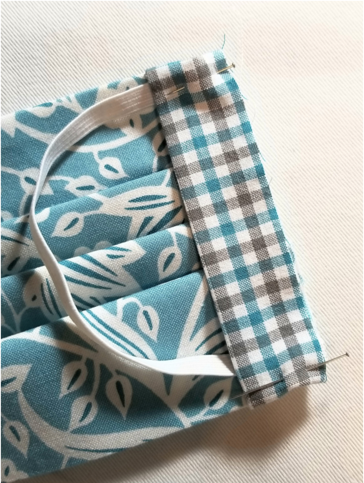
Pin both ends in place.