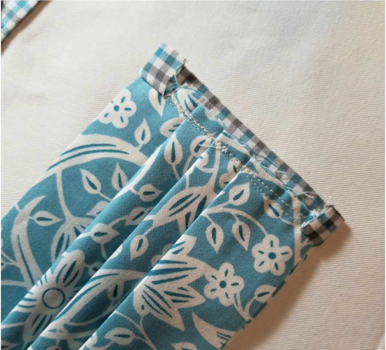
This is what the mask should look like if you flip it over.